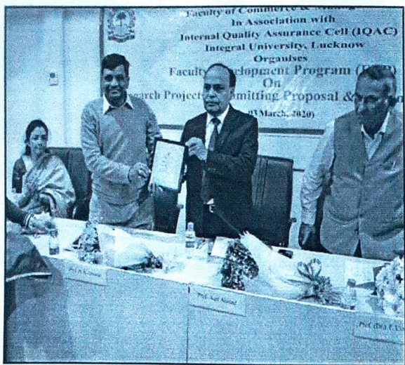
A token of Gratitude to Respected Vice chancellor by Dean FCM