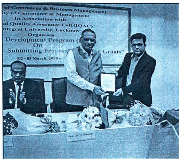
Honouring our Eminent Guest with university Memento by Head DCBM