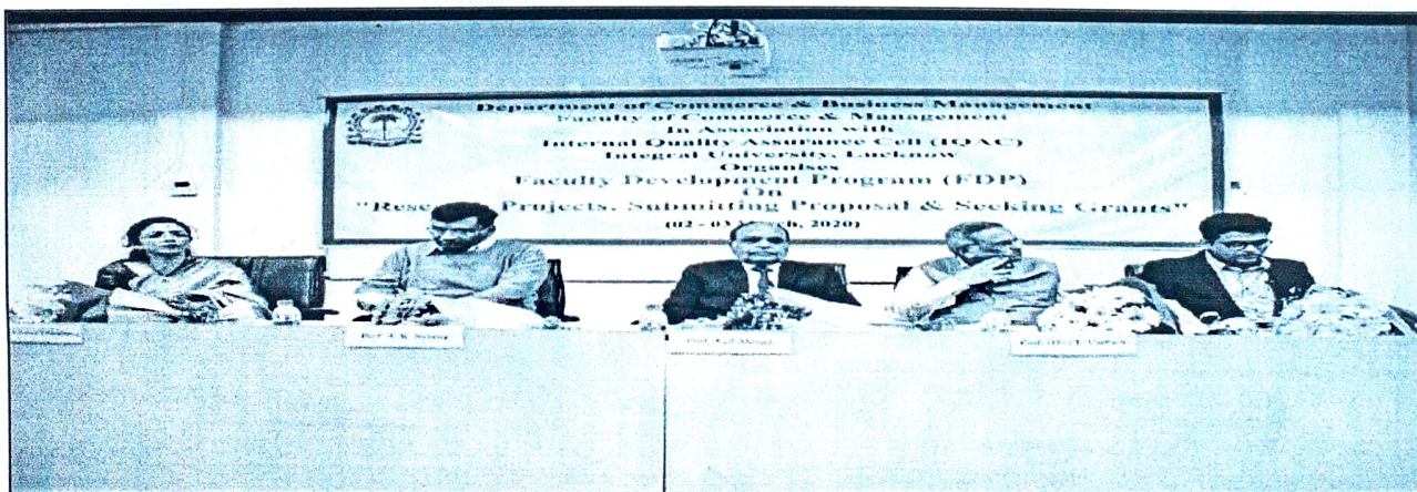
Our Respectable Panel of Guest for the Program

Department of Commerce & Business Management Integral University, Lucknow [Handwritten signature] 02/03/2020